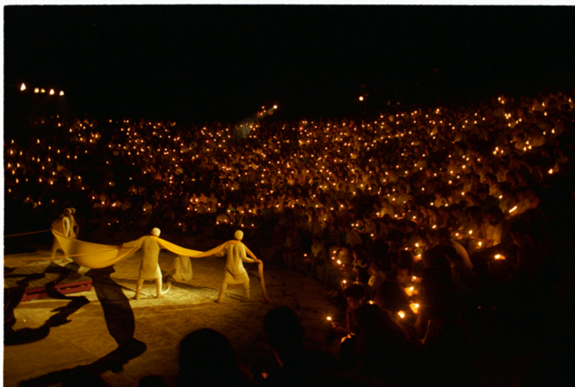
Figure 2: Pharmakas, A. 1994. Euripides' Suppliants, by the Cyprus Theatre Organisation, July 1994 revival, Nicosia, Cyprus.

The photograph below, from the 1994 revival of the play on the anniversary of the 1974 war, perhaps shows one such instance of μυσταγωγία , of methexis between the performers and the audience, who were holding lit candles throughout the performance, as is the custom in some special services of the Orthodox Church.