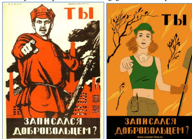
Figure 1: Russian volunteering posters from 1920 and 2010.

The disagreements as to whether crowdsourcing is another form of exploitation or a technological innovation that empowers the users of digital networks can be situated in a historical context. Efforts to mobilize the crowd are not a new thing. The state, as well as other actors, has always been interested in harnessing the power of volunteers and/or in forcing people to “volunteer.” A soldier of the Red Army points his finger toward the viewer on the famous poster from 1920 by Dmitriy Orlov captioned “Have you registered as a volunteer?” (Figure 1). In 2010, the same image was adopted in order to call volunteers to participate in response to wildfires through a crowdsourcing platform, the “Help Map.” 1 The figure of a male soldier was replaced by that of a woman, with the same message and a link to the platform that facilitated citizen-based emergency response (Figure 1). The institutional mobilizer was replaced by an independent citizen engaged in bottom-up mobilization.