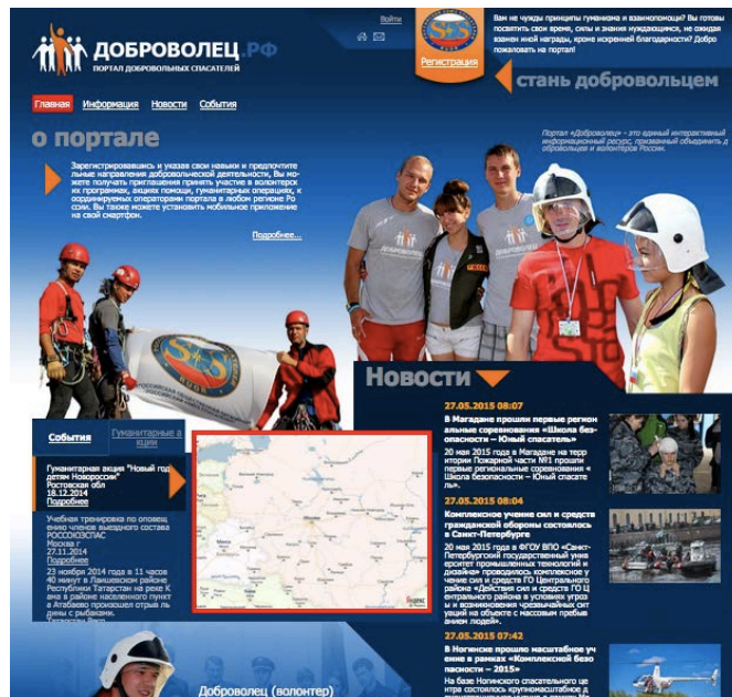
Figure 3: The online version of the front page of Dobrovoletz.rf. (June 2015)

The homepage explains that once a user registers and identifies their skills, as well as preferences for volunteering, they will receive invitations to participate in volunteering programs and humanitarian operations coordinated in any region of Russia. The public-facing news is of a general nature, with a general description of what has happened and the location of the event on the map; the only way to get more information about specific activities of the volunteer community is to join. This requires the provision of information about the skills, certification, physical condition, and availability of the volunteer. If the potential volunteer has official certification as a rescuer or paramedic, they receive the status of professional rescuer, following a process of verification. In other cases, the volunteer receives the status of general volunteer.