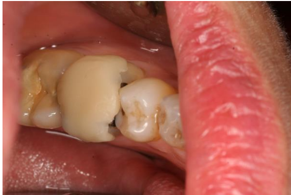
Figure 3. An example of a trial localised supportive composite splint