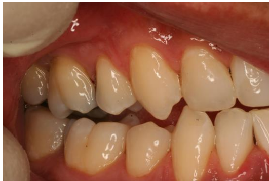
Figure 7. Shows upon right lateral excursion the posterior teeth along with the tooth with the DCS is out of contact with lower right canine guidance.