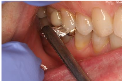
Figure 12. The occlusion has been re-established after a period of 3 months following DCS placement for case shown in figure 10.