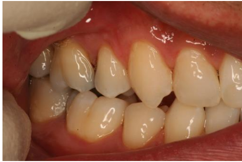
Figure 6. The separation of the teeth is shown here following placement of the DCS.