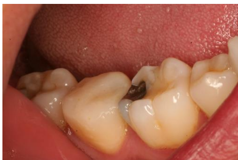
Figure 5. Following confirmation of the alleviation of symptoms with a "trial" splint (as shown in Figure 1) a bonded Direct Composite Splint (DCS) is placed on the lower right second molar tooth.