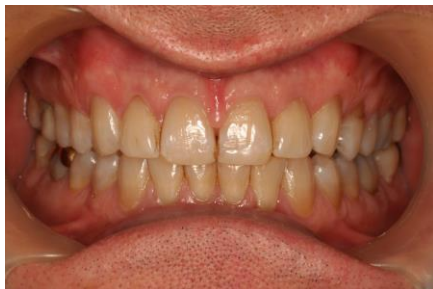
Figure 11. Shows teeth are held separated by the DCS for the case shown in figure 10, however there is no posterior teeth contacting on any excursive movements of the mandible.