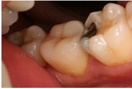
Figure 9. The DCS has been replaced with a Direct composite onlay following resolution of symptoms and reestablishment of the occlusion.