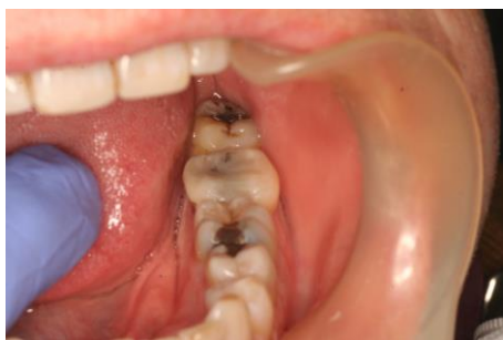
Figure 10 Shows another case where the diagnosed lower left second tooth has had placement of the DCS.