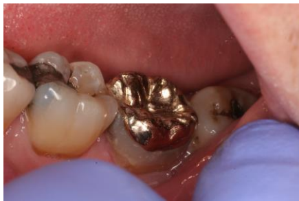
Figure 13. The DCS has been replaced with a Type III cast adhesive gold onlay for the case shown in figure 10.