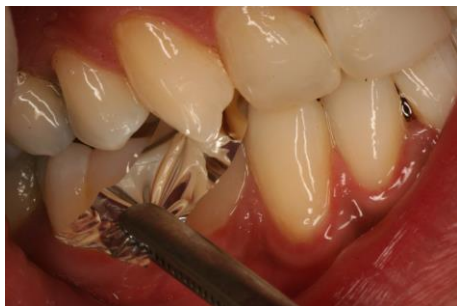
Figure 8. The teeth have now re-established contact in the intercuspal position and the symptoms are resolved from the lower right second molar tooth.