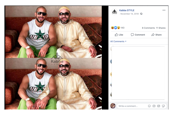
Figure 4 Meme showing King Mohammed VI and Abu Azaitar. Posted on Kabba STYLE Facebook page, 2018.

In a sarcastic tone, participants appropriate a viral global meme, criticized by many for its superficiality and narcissistic character,<sup>i</sup> and become DAAs by taking control of the monarch's life narrative for the moment the meme is alive.