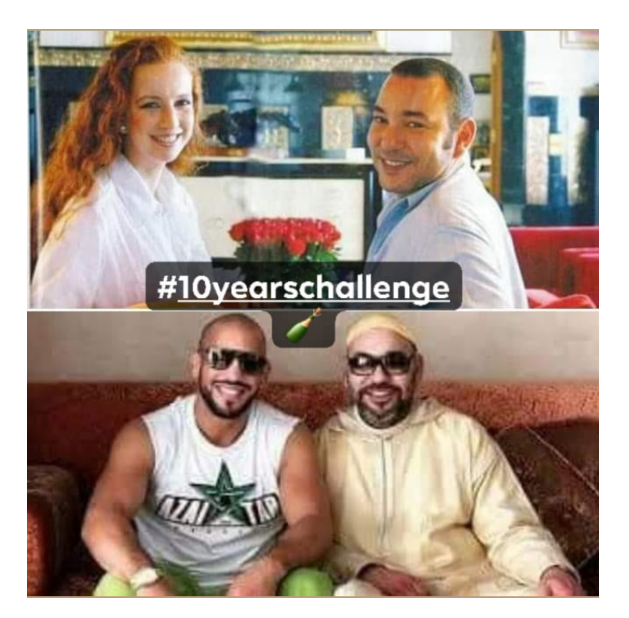
Figure 3 #10yearchallenge meme showing King Mohammed VI, Princess Lalla Salma and Abu Azaitar. Posted on Facebook, 2019.

Further versions of the #10YearChallenge reflect a political use of ugliness as amateurish, unfinished and informal aesthetics that empower ordinary people. Figure 3 shows a picture of King Mohammed VI with his former wife Princess Lalla Salma as the old image and a picture of the King with the German Moroccan UFC fighter Abu Azaitar as the current one. A previous version of this meme (Figure 4) had been published before the #10YearChallenge became viral showing two versions of the second ('current') picture. Both of these images are photoshopped from the original posted on fighter's Instagram account on June 16, 2018. Both of these macros serve as a public acknowledgment of two rumours circulating about the King's private life: his divorce (only made public in the summer of 2019) and an alleged romantic relationship with Abu Azaitar. Considering that article 46 of the 2011 Constitution grants respect towards the King and position him above the law ("the King is inviolable, and respect is due to Him") and that homosexuality is punished by law and not accepted by conservative sectors of the Moroccan society, these memes constitute a public and daring exhibition of contempt towards power. In openly discussing such rumours about the King's personal life and voicing subject matters silenced by local media these memes display ordinary people's potential to shun gatekeepers and speak the unspeakable.