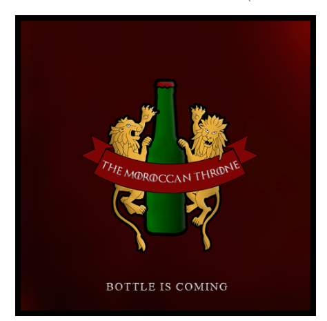
Figure 1 Profile picture of the Facebook page The Moroccan Throne, Posted by The Moroccan Throne Facebook Page, 2019.

a memetic phrase on its own referencing the TV show in its warning of difficult times ahead it (see one example in Figure 1).