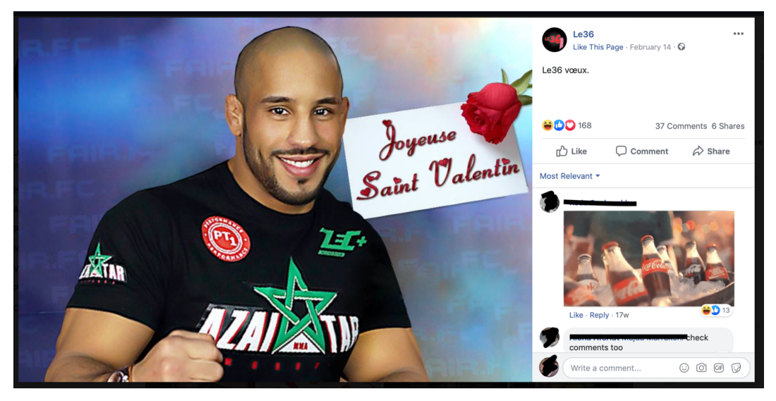
Figure 5 Abu Azaitar with the message "Joyeuse Saint Valentin" (Happy Valentine's Day). Posted on Le36 Facebook page, 2019.

daring message: 10 years ago, the King was the master (handsome, heterosexual married to a woman and the righteous ruler), and now he has become a meme (and the antithesis of all of the above).