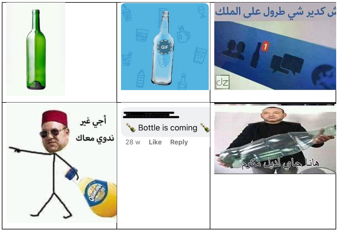
Figure 1 Six bottle memes shared by participants on Facebook comment section.

I divided findings into three intertwined subsections where I examine five macros and the bottle meme. First, I introduce the status of the King in Morocco and discuss the repercussions of digital media in the monarch's public image. Then, the first subsection examines memes related to the viral hashtag #toYearChallenge. This case study shows how what had started as a trivial online hashtag became a space in which to challenge power. The second and third subsections are devoted to the bottle meme present in most comment sections of posts where the monarchy is mocked. Here, I zoom into one of the meme pages from my corpus inspired by the TV show Game of Thrones (GoT) that has capitalized on the bottle meme and GoT themes such as power, modes of governance and class inequalities evidencing the potential for entertainment media and popular culture to denounce systems of oppression. By identifying Political memes and memetic dialectics such as the bottle meme, this methodology allows me to analyse memes discursively within their ecosystem in order to address the main question of this paper: in