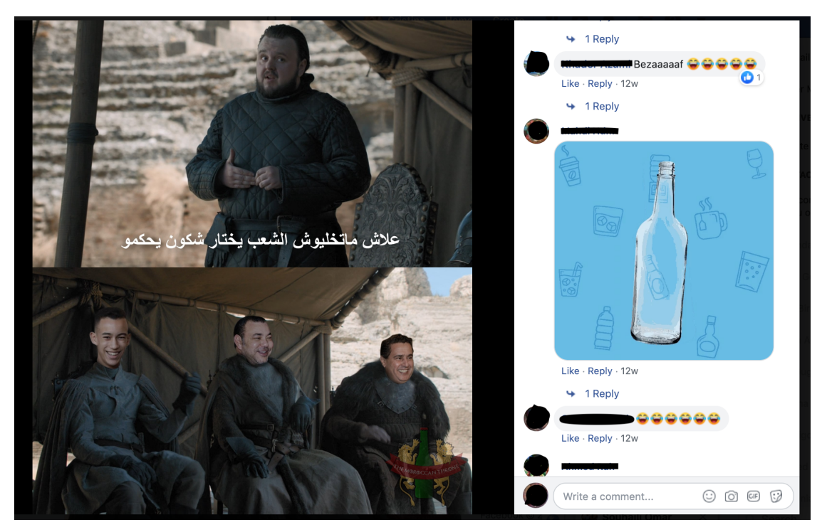
Figure 2 Game of Throne Finale episode meme. Posted by The Moroccan Throne Facebook Page, 2019.

In the perpetuation of the bottle meme and thus building a community that bonds through the acknowledgement of a repressive regime, what Ryan Milner's (2016) calls spread, emotional resonance and collectivism, a banal object like a bottle has absorbed a complex set of meanings in the Moroccan digital imaginary. Still images, GIF's or phrases mentioning the bottle are SAOE that suffice to transmit the message that the page or participant have gone too far and crosses the red lines, creates moments of unity and communal belonging among digital participants as they all relate to a system of torture and fear of the State, all under the rubric of entertainment media. Disguised as humour, the bottle meme and its acquired meaning within TMT's iconography stand at the crossroad between what is entertainment and what is political illustrating that the lines are not that clear. More importantly, even if part of the inspiration for TMT is rooted in an anglophone TV show (and book), the bottle meme is only significant as part of an everyday form of political expression within the Moroccan public world.