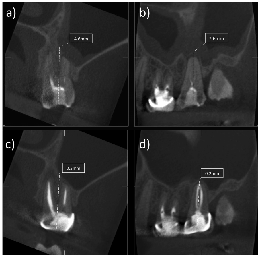
Fig. 1 (a-d). Image showing the pre- and post treatment measurements on the coronal (a,c) and sagittal cone beam computed tomography slices (b,d) related to an upper left second molar area with the relative measurement of the Schneider membrane thickness in mm before root canal re-treatment (a,b) and after one year follow-up (c,d)

0.71 mm, and -2.23 \pm 1.35 mm in the retreatment group. Comparison of the mean membrane thickness for pulp capping cases revealed no statistically significant differences at one-year recall (mean: 5.1 mm vs. 3.8 mm) ( P > 0.05 ).