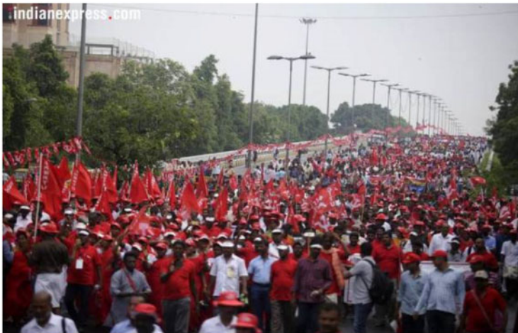
Worker-Farmer Rally in Delhi, September 2018, ©THE INDIAN EXPRESS [P] LIMITED.