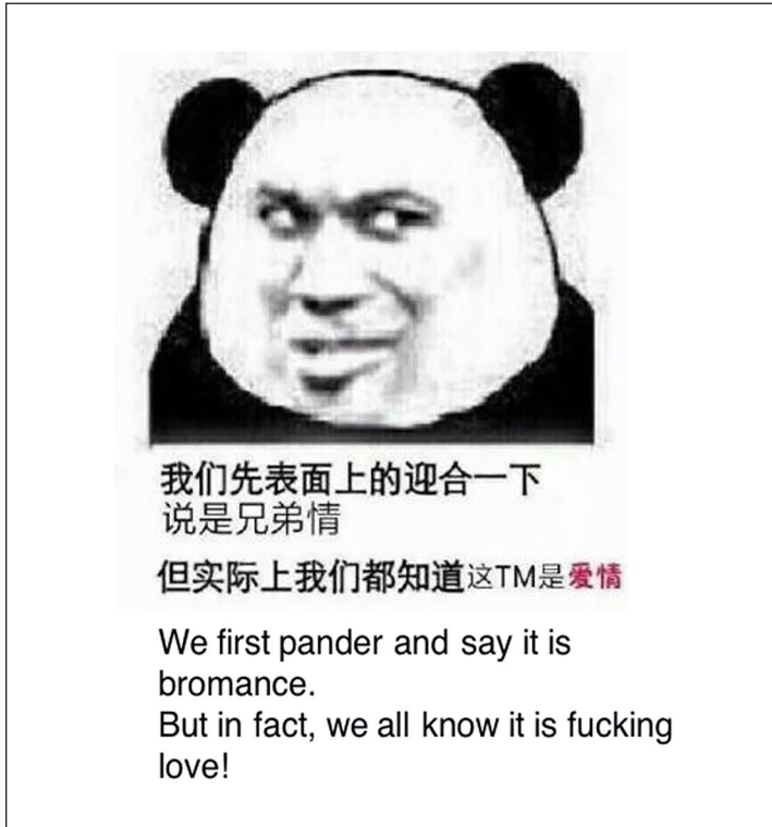
Figure 2. An example of an online fan meme.

The Untamed Girls endeavour to protect from the state censorship. For example, the plot of two protagonists' gazing at each other with lingering looks and narrative excuses for close physical contact has become the meta-source for many fans to create fan-made video clips, cartoon posters or long comments which emphasise the love between the two. At the same, in the comments area of The Untamed Official , there were fans constantly appealing to other fans not to over-publicise the male-male couple and the homo-romance, which may attract the notice of governmental censors. This phenomenon also resonates with the argument proposed by Chiang (2016) - The Untamed Girls are counterpublic but obedient to some extent; they are both untamed and tamed by the heteronormative censorship.