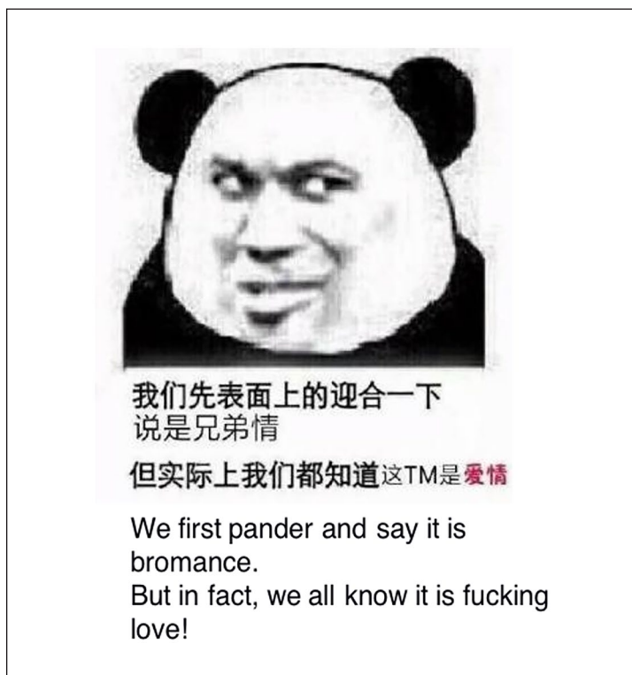
Figure 2. An example of an online fan meme.

The Untamed Girls endeavour to protect from the state censorship. For example, the plot of two protagonists' gazing at each other with lingering looks and narrative excuses for close physical contact has become the meta-source for many fans to create fan-made video clips, cartoon posters or long comments which emphasise the love between the two. At the same, in the comments area of The Untamed Official , there were fans constantly appealing to other fans not to over-publicise the male-male couple and the homo-romance, which may attract the notice of governmental censors. This phenomenon also resonates with the argument proposed by Chiang (2016) - The Untamed Girls are counterpublic but obedient to some extent; they are both untamed and tamed by the heteronormative censorship.