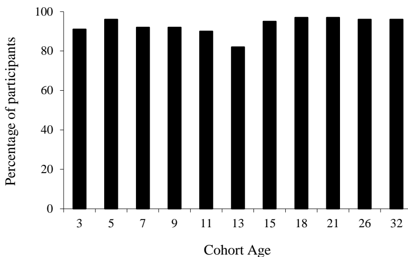
Figure 3: Percentage of Dunedin Study members assessed at each age

Participants were members of the Dunedin Multidisciplinary Health and Development Study, a longitudinal investigation of the health and behaviour of a birth cohort of children born between 1972 and 1973 in Dunedin, New Zealand (Moffitt, Rutter, & Silva, 2001). A total of 1,037 children (52% male) from the cohort (91% of those eligible) participated in the assessment. Perinatal data were collected at birth, followed by participants first taking part in the assessment at age 3 years. Follow-up evaluations were conducted at ages 5, 7, 9, 11, 13, 15, 18, 21, 26, 32 and, most recently, 38 years. Participation rates ranged from 82% to 97% (Figure 3).