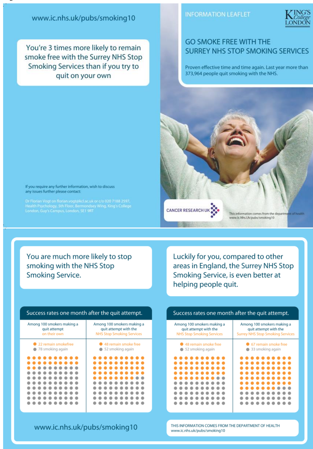
Figure 2. Content of the effectiveness booklet.