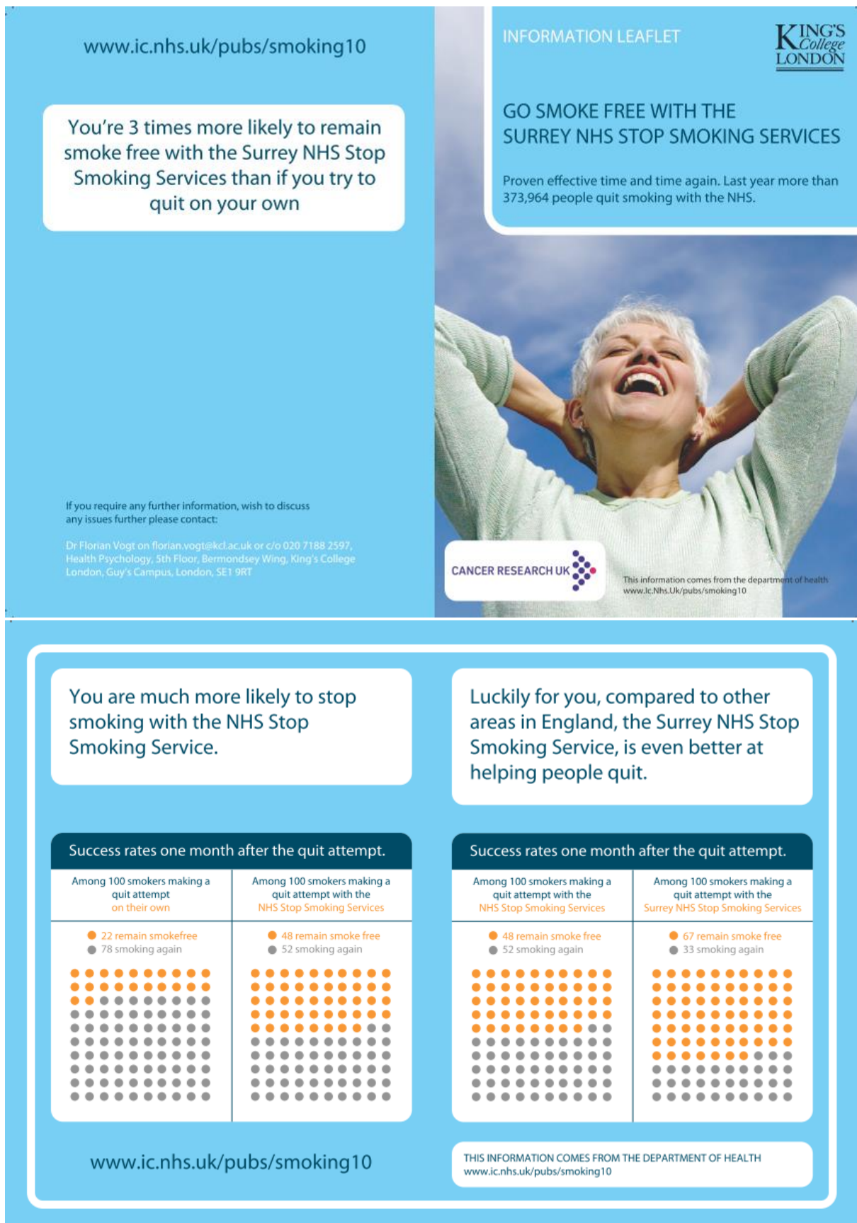
Figure 2. Content of the effectiveness booklet.