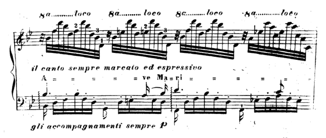
Example 6: Liszt's 'Ave Maria: Lied von Franz Schubert', bar 17.<sup>28</sup>

The 'voice' in Liszt's transcription is an octave lower in both verses, but the real difference in the second verse is the texture provided by the right hand. Yet despite these pieces' popularity, only 'Erlkönig' seems to have been published in London.<sup>29</sup> By contrast, perhaps it was due to these alterations that 'Ave Maria' was published less often.