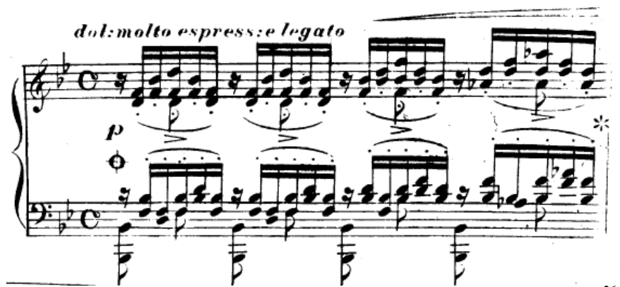
Example 4: Liszt's 'Ave Maria: Lied von Franz Schubert', bar 1.26

These changes continue through verse 1. Whereas Schubert made use of repeats for the second and third verse, Liszt composes new accompaniment for verse two (Example 6 below as compared with verse 1 of Schubert's original shown in Example 5) and does not use verse three at all.