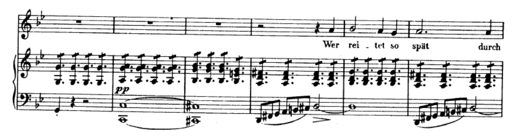
Example 1: Schubert's 'Der Erlkönig', bars 10-16.<sup>23</sup>

own rather than classical compositions.<sup>22</sup> From the documents in Appendix 2 it can be seen that Liszt's renditions of 'Erlkönig' and 'Ave Maria' appear to have been performed the most in England. Their popularity is not surprising given the positive reaction to Schubert's original. Liszt's transcription of 'Erlkönig' is quite true to the original, which aids in creating a similar listener response to the piece for nineteenth-century listeners. The variations are usually down to the voicing in order to differentiate the 'singer's' part, as can be seen below: