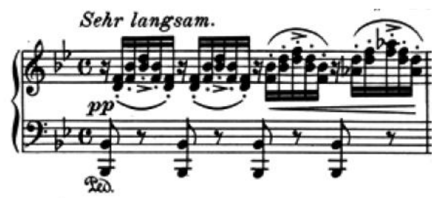
Example 3: Schubert's 'Ave Maria', bar 1.<sup>25</sup>