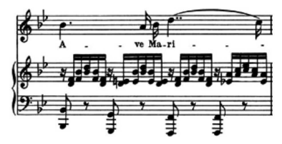
Example 5: Schubert's 'Ave Maria', bar 3.<sup>27</sup>