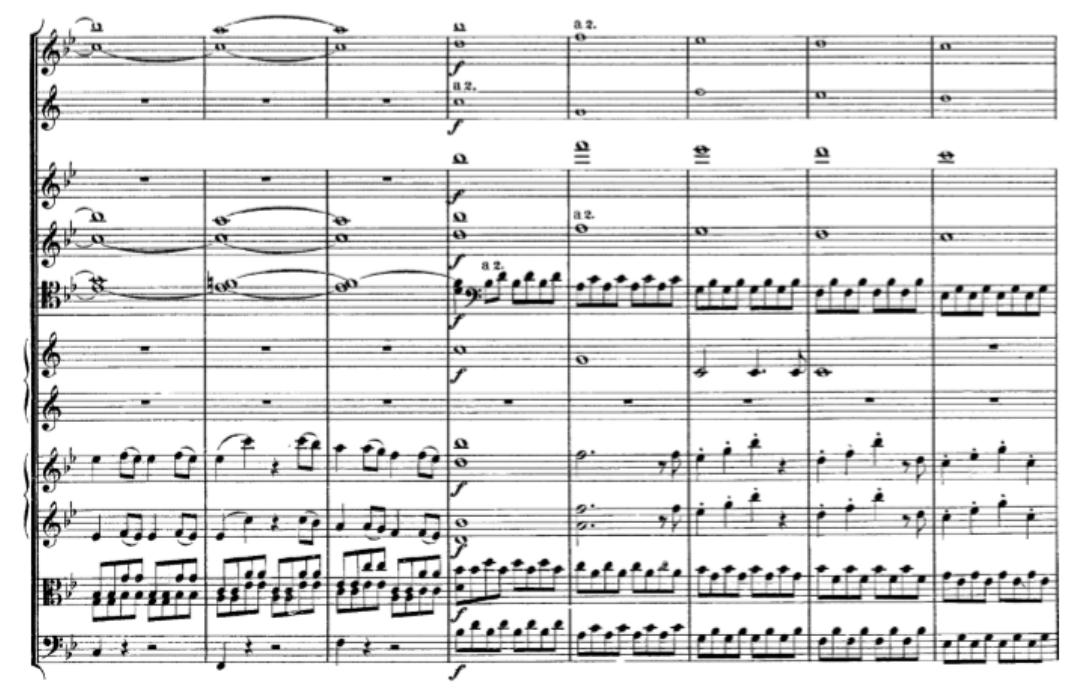
Example 10: Mozart's Symphony No. 40, first movement, bars 25-32.82