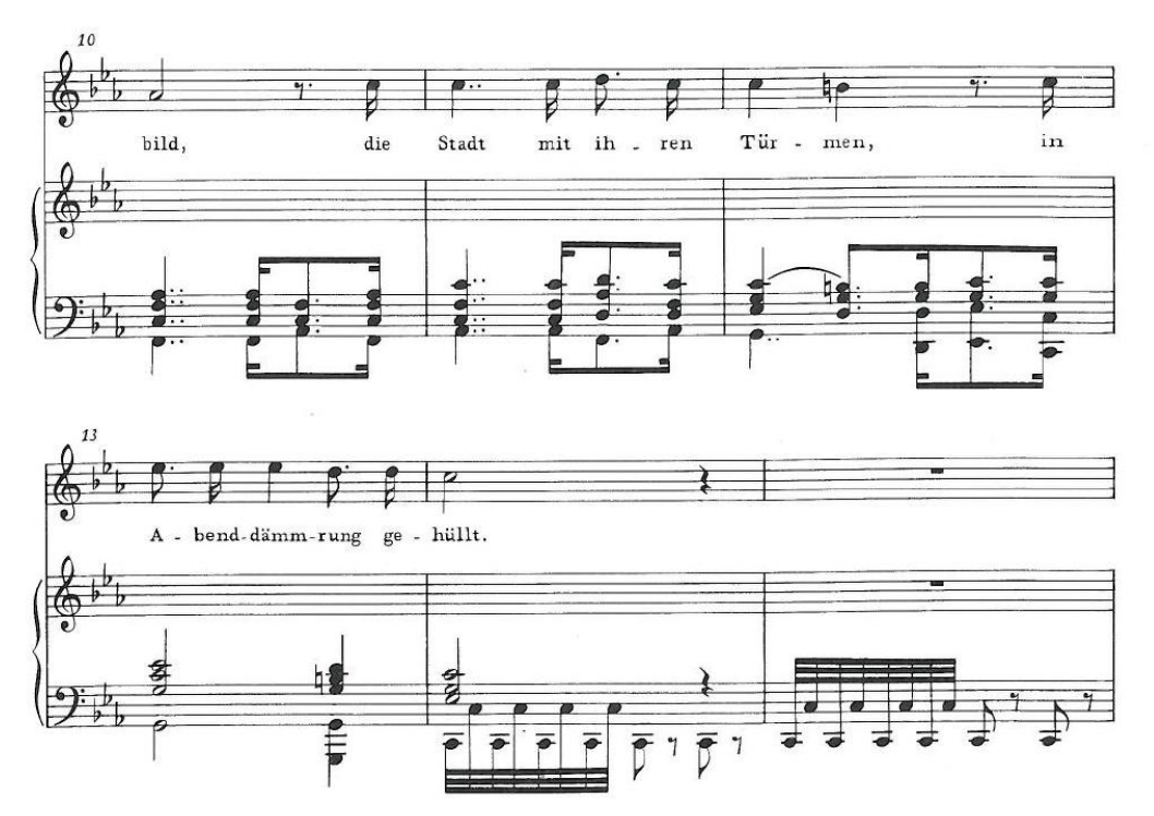
Example 12: Schubert's 'Die Stadt', bars 1-15.74

Hueffer considered Schubert's symphonies and dramatic works to be of little importance when compared to the chamber works and 'inexhaustible treasures of song'. 75 The operas' failure was caused, he thought, by Schubert's poor choice of librettos. Problematic for followers of the 'music of the future' was Schubert's ability to compose beautiful tunes irrespective of the text of the dramatic works - contrary to the key doctrine of the movement. Unfortunately, Hueffer wrote little else regarding the symphonies or chamber works.