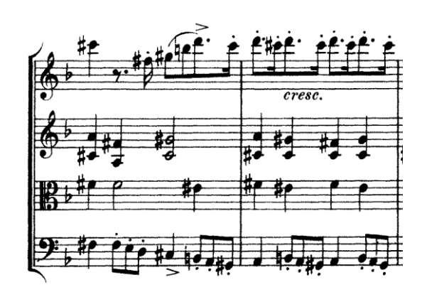
Example 7: Schubert's Quartet in D minor (D810), first movement, bars 153-154.<sup>68</sup>

These comments must be put into perspective. The piece can be characterized by frequent and often sudden changes in dynamics, which could lead the critic above to use the word 'harsh'. Yet this is not the only example. The first movement is littered with triplets and dotted quavers often happening simultaneously as in the example below.