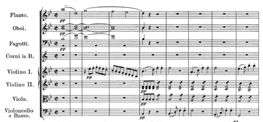
Example 11: Schubert's Symphony No. 5, first movement, bars 1-9.83

The critics were accurate in their comparisons, however lacked specific references to prove their claims adequately. Whilst the association with Haydn and Mozart can be either helpful or detrimental, in the case of these reviews, it was relatively positive.