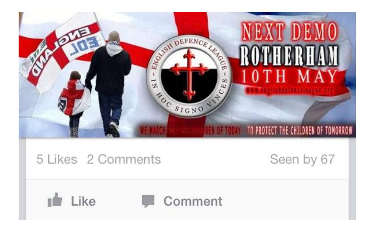
Figure 2: Official EDL Promotional Material for Demonstration in Rotherham on 10 May 2014

The organisation itself promotes the idea that participation will enable members to protect their families, as the EDL promotional material presented in Figure 2 below shows: