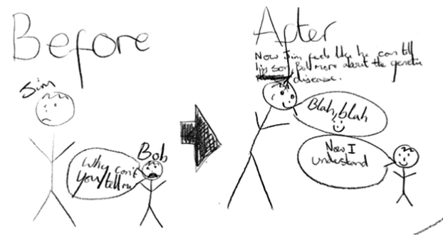
Figure 2 A picture showing a family before and after attending the MFDG intervention. In the before image the child is sad and confused asking their parent "why can't you tell me?" In the after picture the child is happier because he understands what is happening in his family because his parents have been 'able to tell his son a bit more about the genetic disease'.

Logistical challenges such as travel costs and/or child care costs were also seen as a barrier for some families' participation. The most prevalent barrier to attending the MFDG however were parents' anxieties surrounding children's exposure to other IGCs. Parents