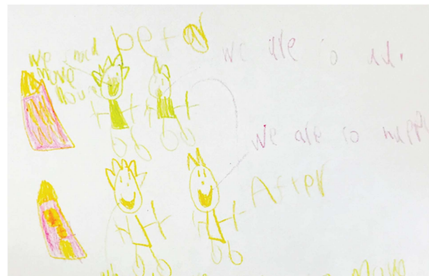
Figure 3 A picture showing the child's family before and after the intervention. In the before picture, the child has written by an image of his home 'we are so sad' and in the after picture the child has written 'we are so happy'.

perceived that being exposed to families with children affected by life-limiting conditions would upset their children.