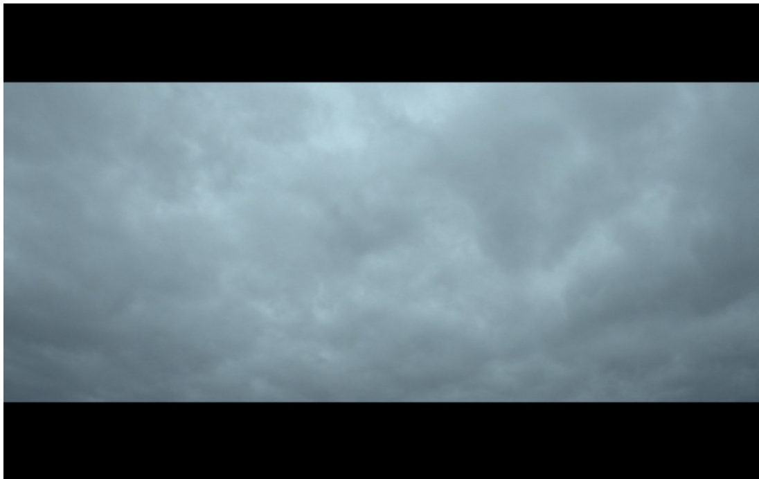
Figure 25. The camera tilts upwards, but unlike in Breaking the Waves , there is no direct visual “evidence” of the divine or miraculous.

In fact extraordinary camera movement notwithstanding, the final shot of Stations is resolutely rooted in the natural. Opening with a mechanical digger heaping mud onto Maria’s open grave, it is sound-tracked by the dull crunching of operating machinery, and the penultimate sight it offer us is of Christian, Maria’s only friend, shuffling away from the grave with his hands in pockets, before the camera tilts to look upwards, towards the clouds. Since we have so far seen events through the fixed and rigid position of the art gallery patron, the possibility that we are witnessing a point of