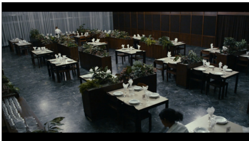
Figure 1. The opening shot of Lourdes .

The events of Lourdes turn around the visit of a group of pilgrims and their carers, members of the Order of Malta led by the devout Sister Cecile, to the holy site. Shot by Martin Gschlacht, with production design by Katharina Wöppermann, the film is cast in a heavily restricted colour palette consisting of muted colours with strong elements of fire engine red and cerulean blue: the red of the uniforms of the Order of Malta and the blue of the Virgin Mary [7]. It opens with a high angle, wide shot of an empty hotel conference centre, which slowly fills from either side of the screen with characters, including Christine (Sylvie Testud), pushed in her wheelchair into the centre of the shot (Figure 1). A certain theatricality in the film’s staging and shooting is thus announced from the outset, and Hausner explains that throughout the film, “the actors move almost as if they were in a ballet—they move in and out of a static frame that for its part stays detached and cool” [7]. She adds that the camera, “is like God’s Eye—observing, never interfering” [7].