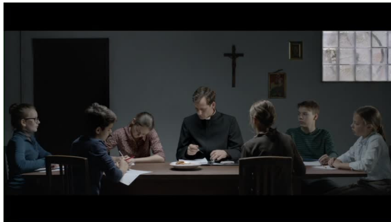
Figure 13. The opening scene of Stations of the Cross .

back door of the room) look more like two-dimensional planes overlapping (as rectangles) rather than a receding series of volumes. Despite its actual depth, the recessive image feels very flat.