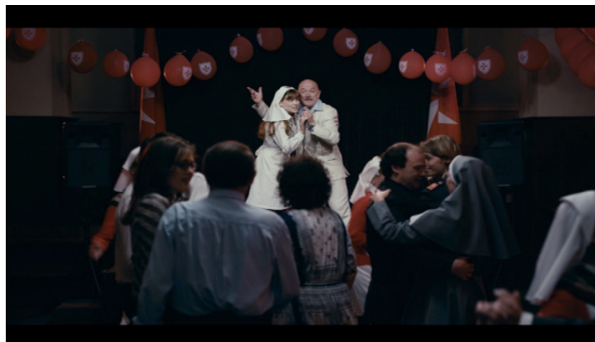
Figure 10. A planimetric shot sees the party continuing.