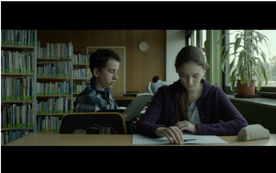
Figure 17. Chapter 3, Stations , “Jesus falls for the first time”.

The film emphasises its construction, putting the tight framing to double work as it also provides a visual echo of the film’s theme of fundamentalism and oppression. Maria is literally boxed in. In chapter five, “Simon of Cirene helps Jesus to carry the cross”, Maria sits alone in a confessional, the small squares of the grill casting shadows on her face (Figure 18). In chapter four, “Jesus meets his mother” she is framed in two shot with her mother through a car windscreen (Figure 19). In three sequences, we see small groups positioned around a table, the perpendicular lines of the framing mirrored by the crucifixes that litter the background walls and the books that serve as an alternative to the pernicious pleasures of “a world of TV and Facebook and people who’ve sold their souls to be dead in the middle of life”. Like Lourdes , too, Stations features a scene in which characters pose for a group portrait, taking the planimetric aesthetic that underpins the two films to its logical extreme (Figures 20 and 21).