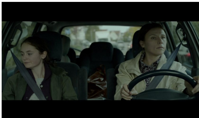
Figure 19. Chapter 4, Stations : “Jesus meets his mother”.