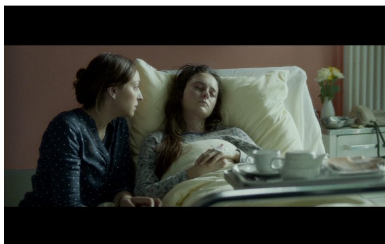
Figure 15. Chapter 11, Stations , "Jesus is nailed to the cross": Maria as Imago Pietas.