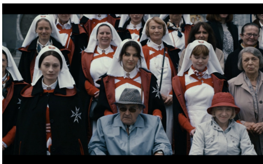
Figure 20. Lourdes 's pilgrims line up to have their portrait taken.