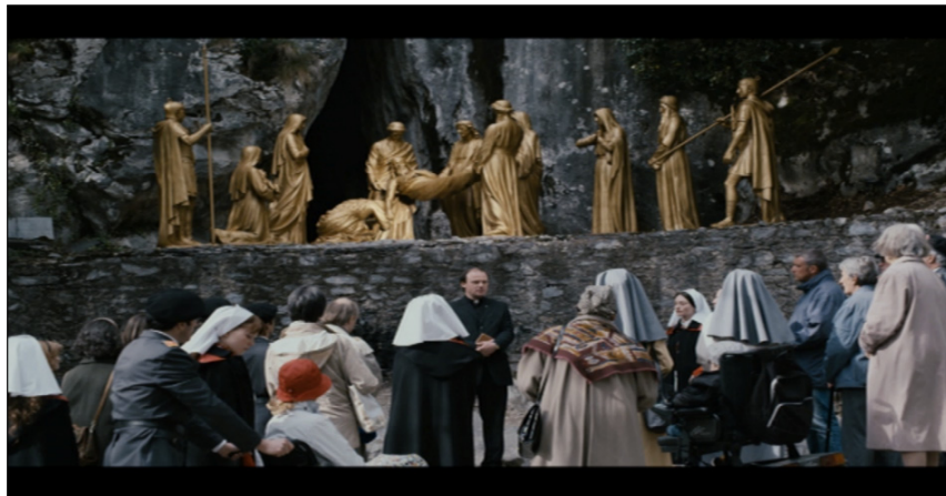
Figure 12. The pilgrims at Lourdes Grotto.