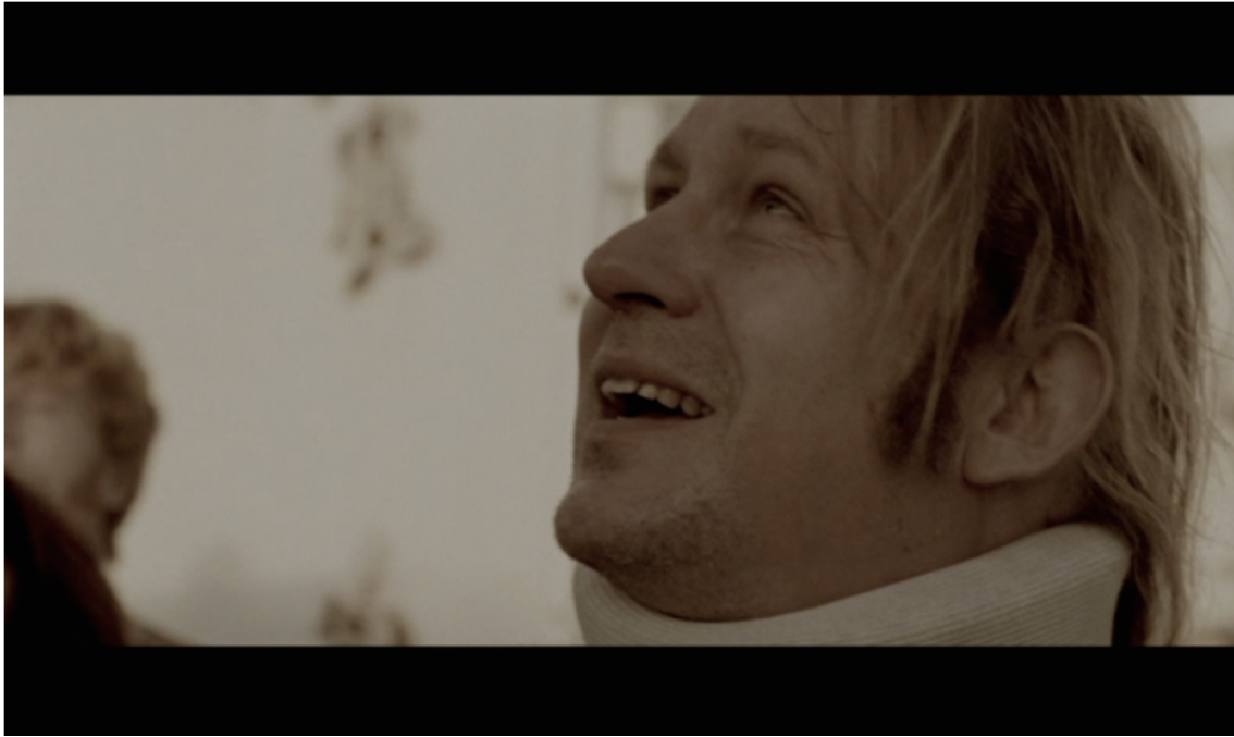
Figure 22. Jan buries Bess at sea at the close of Breaking the Waves .

following the heroine's martyrdom: in the former, Jan walks; in the latter, Johannes speaks. Yet the appeal that Von Trier's film makes to certainty—via bodily knowledge, via divine knowledge—is markedly lacking from Brüggemann's film.