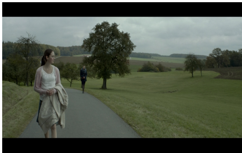
Figure 14. Chapter 2, Stations , "Jesus carries his cross": Maria as Madonna of the Meadows.