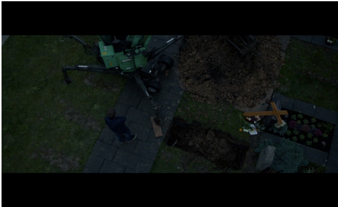
Figure 24. Christian stands at Maria’s grave in the final sequence of Stations of the Cross .