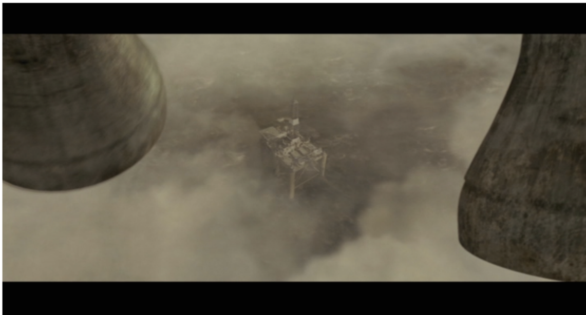
Figure 23. The final shot of Breaking the Waves makes a move to the supernatural, as heavenly bells peal.