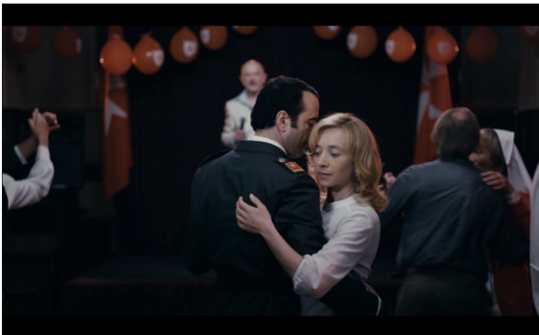
Figure 5. A closer shot of the dance.