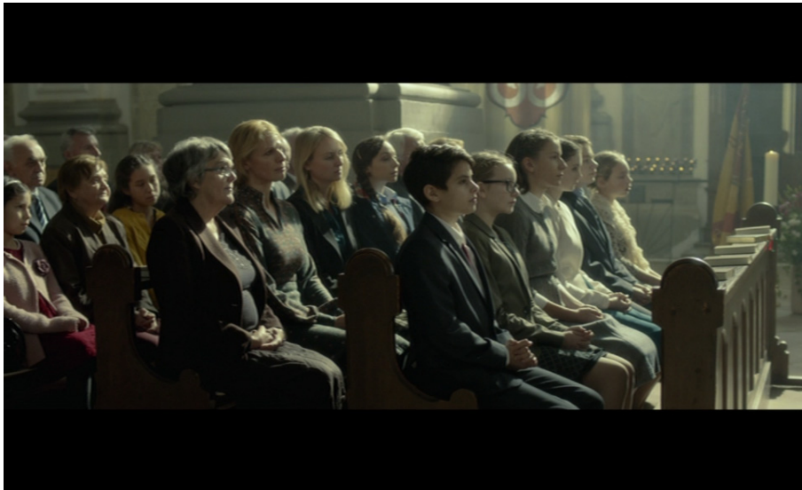
Figure 16. Chapter 9, Stations , “Jesus falls for the third time”.