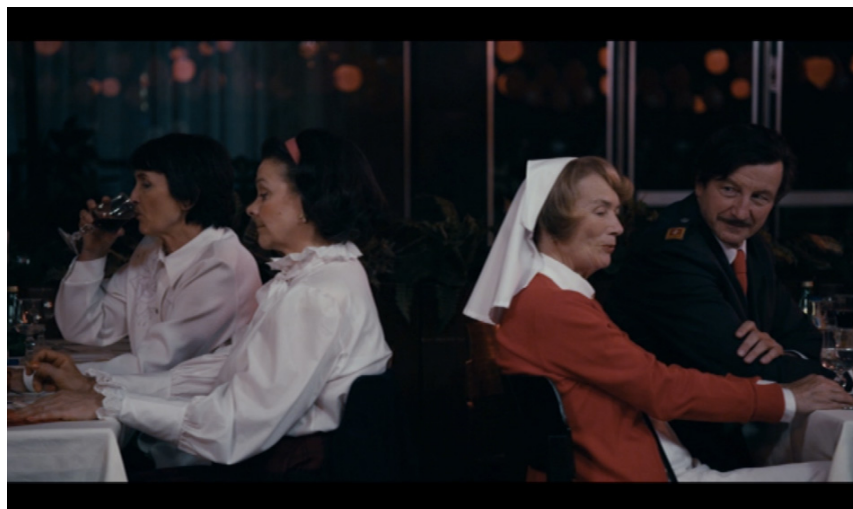
Figure 8. The “greek chorus” of Lourdes , lined up in a reverse V formation.