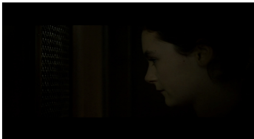
Figure 18. Chapter 5, Stations , “Simon of Cirene helps Jesus to carry the cross”.