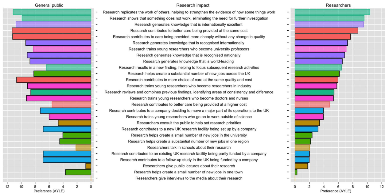
Figure 3 Preferences for different types of research impact, expressed as additional years of life expectancy (AYLE) for 10% of adults living with a common chronic disease in the UK. Note that the shaded (non-transparent) boxes illustrate impacts that are statistically different between the general public and researchers.