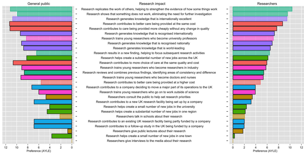
Figure 3 Preferences for different types of research impact, expressed as additional years of life expectancy (AYLE) for 10% of adults living with a common chronic disease in the UK. Note that the shaded (non-transparent) boxes illustrate impacts that are statistically different between the general public and researchers.