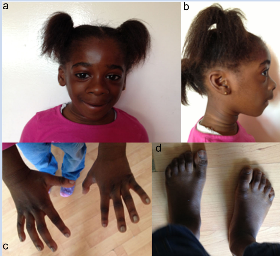
FIG. 2. a and b: Clinical photographs demonstrating features of skin wrinkling, frontal balding, broad nasal base, upturned nasal tip, thick alae nasi, broad and long philtrum, thin upper vermilion, and thick lower vermilion, anterior projection of the upper lip over the premaxilla. c: Clinical photographs of hands with slightly thick distal phalanges. d: Clinical photograph of feet. [Color figure can be viewed at wileyonlinelibrary.com ].