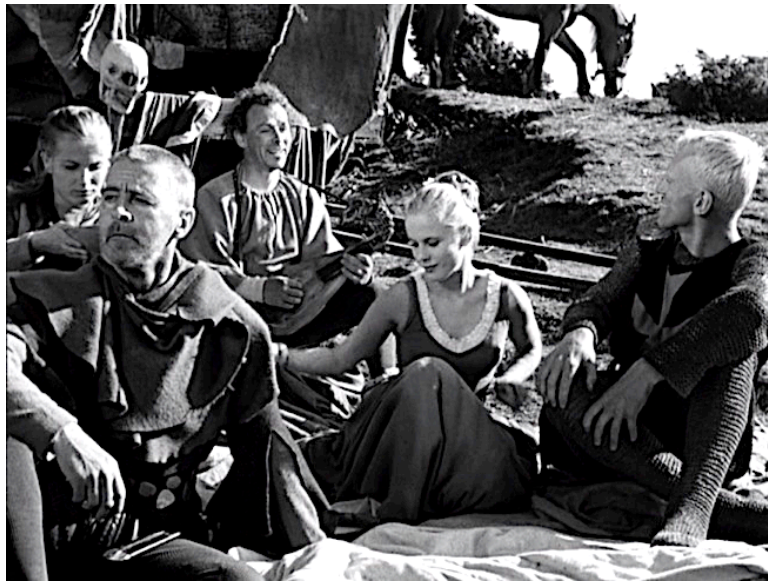
Jof plays the lute and sings to his friends in the countryside

Bergman’s travelling musicians, like Jof and Mia, are closely tied to his portrayal of circus artists, notably in The Naked Night ( Gycklarnas afton , 1953), and magicians/illusionists, as in The Magician ( Ansiktet , 1958). 62 These nomadic troupes of second-rate entertainers,