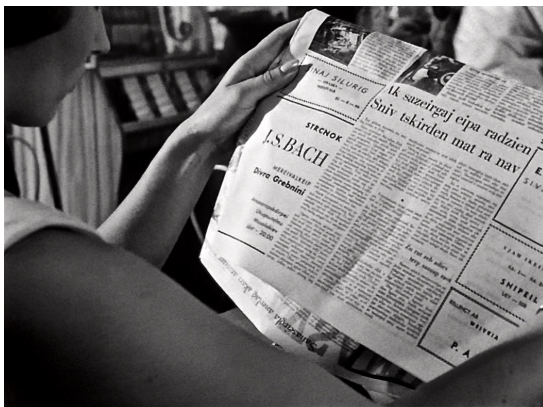
J.S. Bach in the newspaper