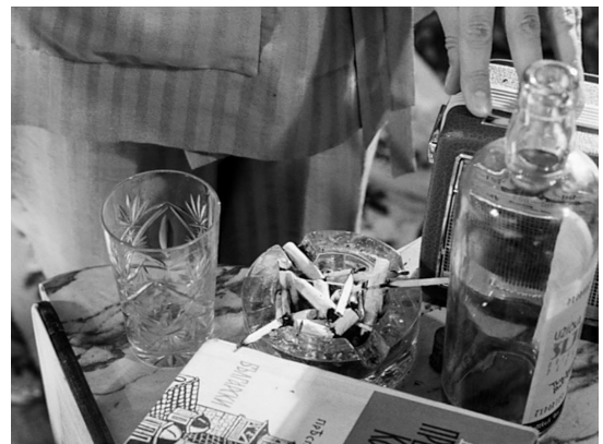
Self-medication still life: cigarettes, vodka, jazz