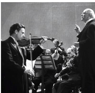
Things start to go wrong