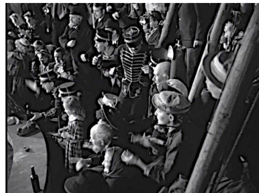
The jeering crowd

Just as audiences are necessary to performance in general, they are also crucial to Bergman's performance-humiliation scenes, whether as a riotous crowd, a knowledgeable classical audience, or, as we will see later, a single person. But Bergman's treatment of these audiences differs vastly depending on the location and genre of the performance. The spectators in The Seventh Seal and The Naked Night are shown as large crowds, jeering, shouting, laughing. We, as spectators of the spectators, are shown their faces and hear their cries, just as we are shown the performers' songs and gestures. But the spectators in To Joy