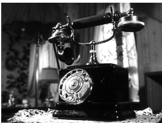
The telephone rings