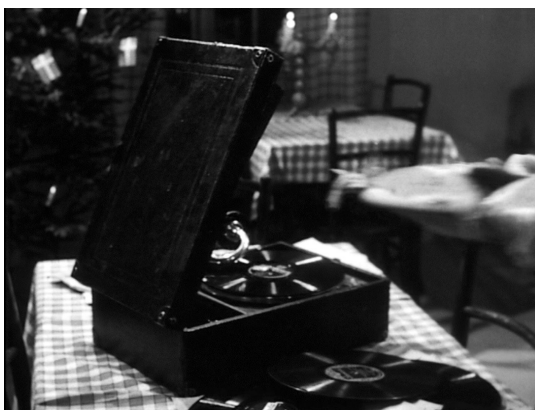
Visual emphasis on gramophone