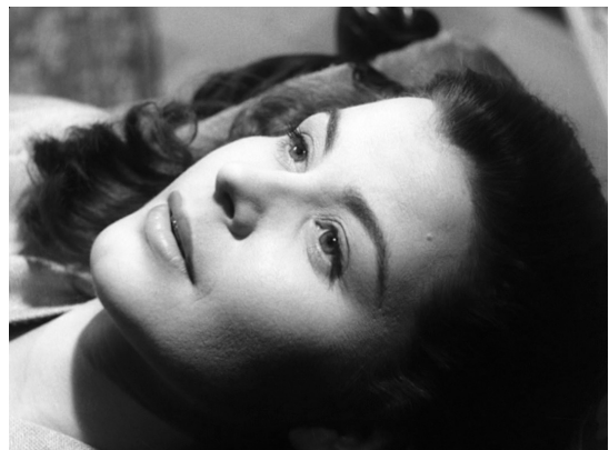
Listening to Gluck