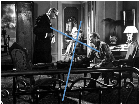
Figure 2k: Religious iconography