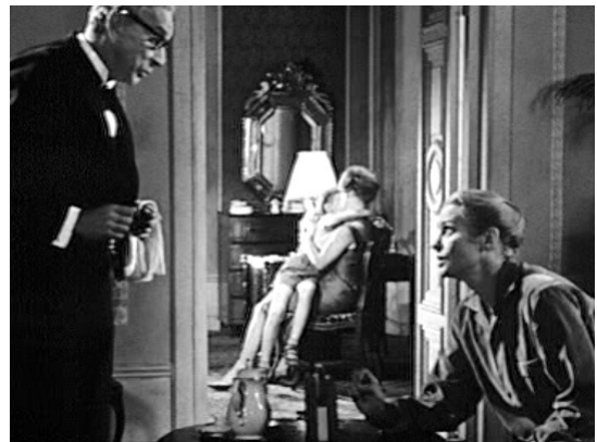
Listening to Bach in The Silence : the hidden cruciform A close-up of the Anna-Johan pietà