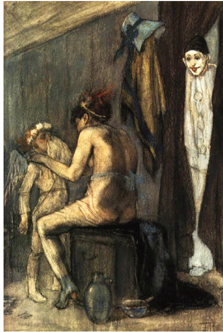
Venus and Cupid (1878-81) by Belgian artist Félicien Rops. Pierrot is seen peeking out from behind the curtain.