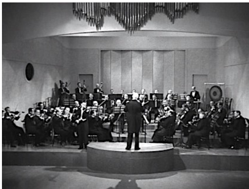
Stig in front of the orchestra