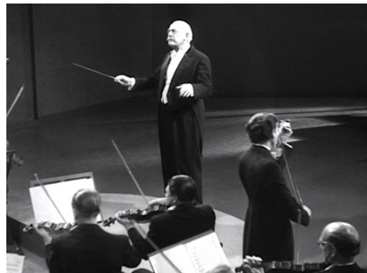
No audience is shown