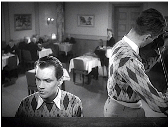
Performing “The Maiden’s Prayer”