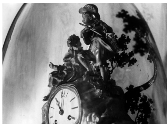
The pastoral clock with flute and lyre