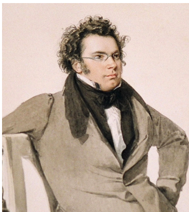
A drawing of Schubert that Bergman pasted into his workbook for this film. 143