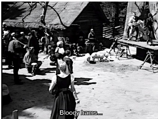
The makeshift stage