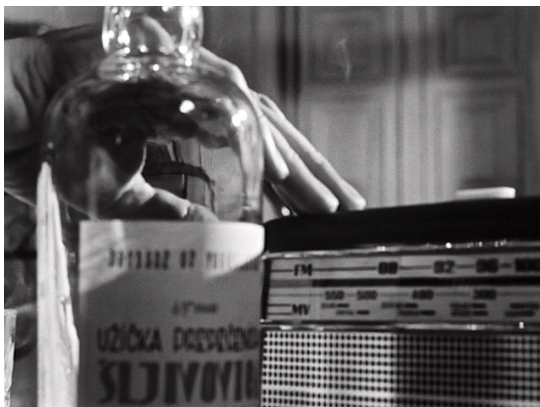
Ester turns on the radio