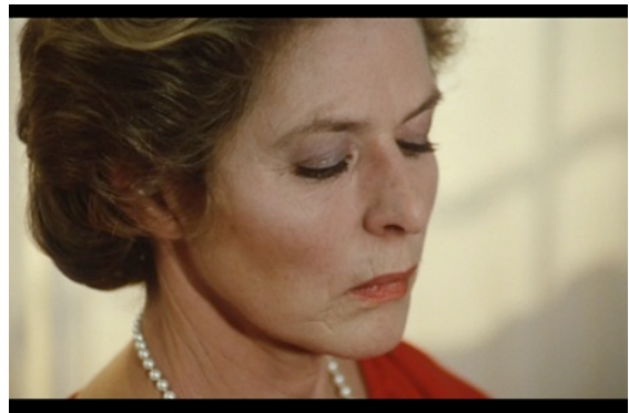
Charlotte's face as she plays the prelude

Then the camera cuts to a tight close-up of her profile in the foreground, Eva's face square to the camera, her eyes fixed on her mother's face.