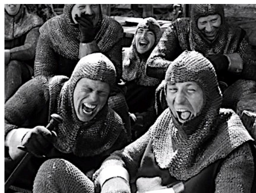
The jeering crowd