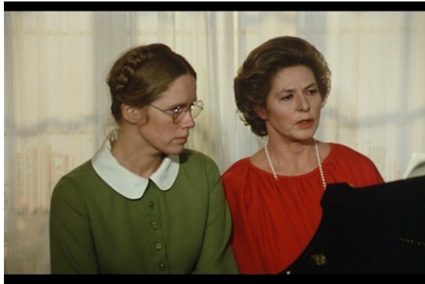
Figure 3k : Autumn Sonata , Charlotte talks about Chopin

Charlotte: Chopin isn't sentimental, Eva. He's very emotional but not mawkish. There's a huge gulf between feeling and sentimentality. The prelude you played tells of suppressed pain, not of reveries. You must be calm, clear, and harsh. The temperature is feverishly high, but the expression is manly and controlled. Take the first bars now. It hurts but I don't show it. Then a short relief. But it evaporates almost at once and the pain is the same , no greater, no less. Total restraint the whole time. Chopin was proud, sarcastic, passionate, tormented, furious, and very manly. In other words, he wasn't a mawkish old woman. This second prelude must be made to sound almost ugly . It must never become ingratiating. It should sound wrong . 108 You must battle your way through it and emerge triumphant. Like this.