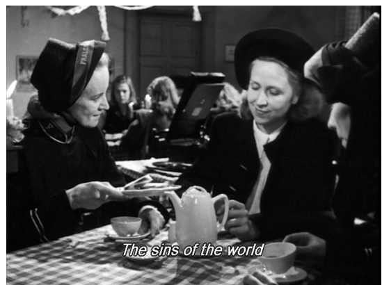
Gramophone separates the social workers (foreground) from the girls (background)