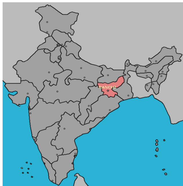
Figure 1: The state of Jharkhand in eastern India

Jharkhand presents an important context to study the role of non-cognitive skills in advancing outcomes of vulnerable females. Created in 2000, the eastern state of Jharkhand ranks among the most lagging states in terms of poverty, female literacy, maternal mortality etc.